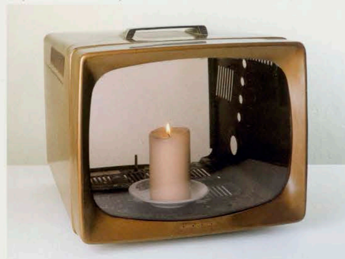
Nam June Paik Candle TV 1975