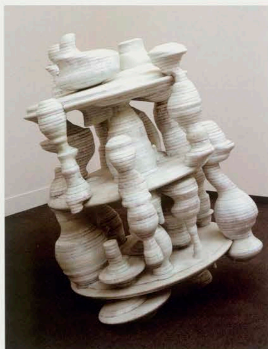
Tony Cragg Flotsam 1997

Meanwhile, in post-war Germany there was a desire to rehabilitate Modern art after it had been banned under National Socialist policy. While some artists wanted to pick up the lost scene, others tried to catch up with the contemporary artistic trends in Europe. They saw abstract art – USA's Abstract Expressionism and France's Art Informel – as the artistic international language of freedom and democracy, embracing the Modernist notion of the autonomy of artistic practice and non-representational art as a rejection of nationally driven traditions. Germany's new cultural policy embraced these trends, reflecting a reborn confidence in the expression of a democratic new way of life through the arts. Initiatives such as the creation of Documenta in 1955 are exemplary of Germany's struggle to gain the world recognition as an artistic and free Western country. It welcomed the migration of artists and artistic influences. French artist Yves Klein's first exhibition