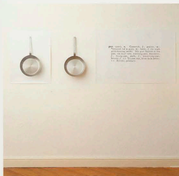
Joseph Kosuth One and three pans 1965

Since the 70s, Germany's pluralist art system allowed the development of the artistic practices of key national and international figures such as Joseph Beuys, Jannis Kounellis, Georg Baselitz, Luciano Fabro, Markus Lupertz, Jörg Immendorff, Sigmar Polke, Gerhard Richter and Per Kirkeby. International artists were drawn to the rich discourse of German academies and the work opportunities offered by them. Many came from the USA or Europe with scholarships through the German Academic Exchange Services (DAAD) including Edward Kienholz and