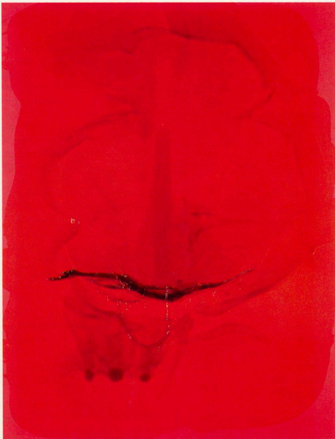
The smell 1996 varnish on acrylic on linen, 2600 x 2000mm